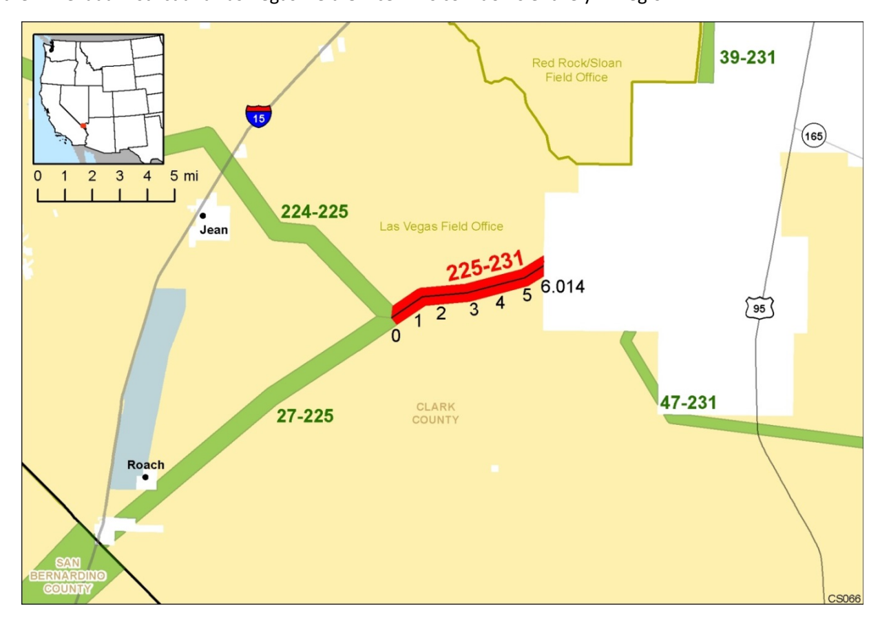
Figure 1. Corridor 225-231

Corridor 225-231 (Figures 1 and 2) is a short corridor that extends west-east south of Las Vegas in southern Nevada, providing a connection for multiple electric transmission lines to cross BLM-administered land. The corridor begins at the junction of Corridors 224-225 and 27-225 and is north of the South McCullough Wilderness Area. Federally designated portions of this corridor are entirely on BLM-administered land, with a 3,500-ft width over its length. Corridor 225-231 is designated as multi-modal and can therefore accommodate both electrical transmission and pipeline projects. The corridor spans 6 miles, with all 6 miles designated on BLM-administered lands. The corridor's area is 2,532 acres or 3.96 square miles. This corridor is entirely in Clark County, Nevada, and under the jurisdiction of the BLM Southern Nevada District and Las Vegas Field Office. This corridor is entirely in Region 1.