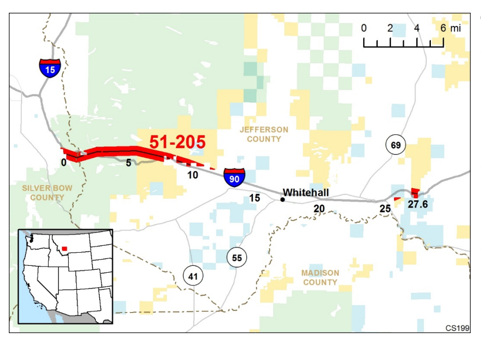
Figure 1. Corridor 51-205