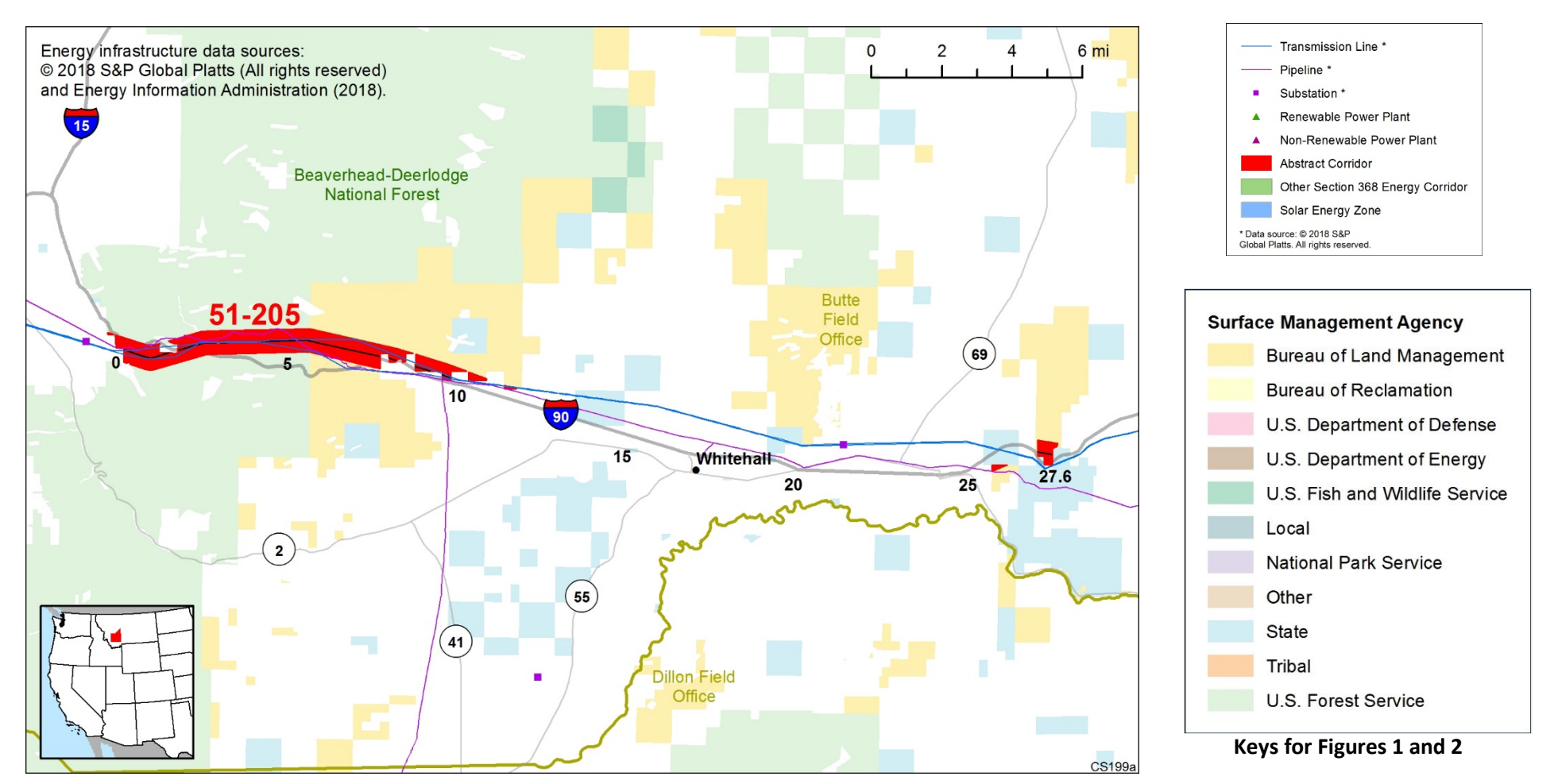
Figure 2. Corridor 51-205 and nearby electric transmission lines and pipelines